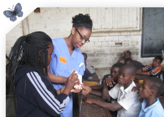
... and this is how you floss your teeth ...ohhh

Dental floss lands in Majengo ... along with toothbrushes, toothpaste, volunteers and dental professionals for One Lamb's first ever dental camp . On 13 th June, 75 kids were screened, over 150 were instructed on proper oral hygiene, and all received packs which contained